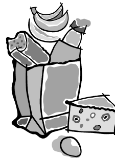
7 simple ways to save money at the checkout!