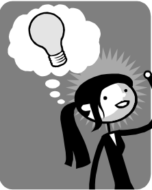
Tips for all aspects of life

SAFETY- One of the things I'm trying to work on is time management. Unfortunately, many accidents in and out of the home are caused when we hurry, mainly because we tend to act less safely. To keep this from becoming a factor, try to plan well, adding time to cover unexpected delays. If you feel yourself getting in a hurry, whether it is cooking, getting out the door, or driving, stop for a moment to slow down. Give those waiting for you an update to let them know you will need a little more time. If you find yourself habitually rushing around, it may be time to take stock of your time management abilities and make a resolution to give yourself enough time to complete all of your tasks in a reasonable amount of time.