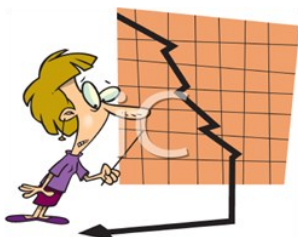
Financial Crisis Report