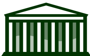
Advancing in a Time of Crisis