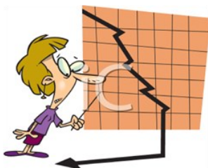
Financial Crisis Report

Asian-Americans would come at the price of lower rates of admission for African-Americans. Opponents of affirmative action — including the Project on Fair Representation, which helped bring the new suit — like to link the two issues, but they are unrelated.