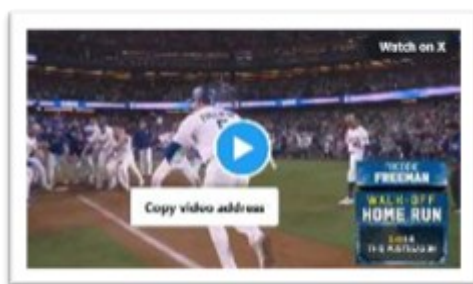
October 27, 2025, Game 3 of the 2025 World Series between the Dodgers and Blue Jays was an 18-inning epic, ending in a 6

casted to bring catastrophic winds, storm surge, and flooding, with widespread evacuations and shelter openings in Jamaica; Melissa is the most powerful hurricane globally in 2025 and poised to be the strongest hurricane to ever directly strike Jamaica, surpassing Hurricane Gilbert (1988); Marks the first time in 20 years that three or more Category 5 hurricanes have formed in the Atlantic in one season—the last time being 2005.