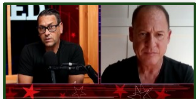
From Redacted 8-6-2025