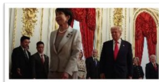
October 28, 2025, President Donald Trump met Japanese Prime Minister

vid Ortiz and Carlos Correa; Shohei Ohtani had a legendary performance: Reached base nine times, a World Series record. Hit 2 home runs, 2 doubles, and drew 5 walks; Other homers: Teoscar Hernández (Dodgers) in the 2nd inning; Shohei Ohtani (Dodgers) in the 3rd and 7th innings; Alejandro Kirk (Blue Jays) with a 3-run shot in the 4 th ; Pitching and Strategy; Starting Pitchers: Max Scherzer (Blue Jays) vs. Tyler Glasnow (Dodgers); Total Pitchers Used: 19 across both teams.