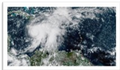
October 27, 2025, Hurricane Melissa became a Category 5 storm, with sustained winds reaching 175 mph with gusts reaching 200 mph approaching Jamaica; Fore-

pact; The investigation spanned 11 states and lasted several years; FBI Director Kash Patel described the operation as involving “tens of millions of dollars in fraud, theft, and robbery”; The NBA itself has not been charged, but the scandal has raised serious questions about internal controls and integrity.